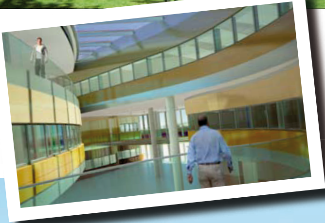
Above and left: Well-insulated windows allow natural daylight to help light the building without causing it to overheat.

The project broke ground in August 2009. Phase one involves construction of the school building, which commenced in November 2009. Carried out by contractor Heijmans Utiliteitsbouw BV, work comprises drilling piles and pouring in the foundations, and laying the pipeline for the water and sewage system as well as for the heating and cooling system. It also includes installing the insulation, reinforcement and underfloor heating system for the building.