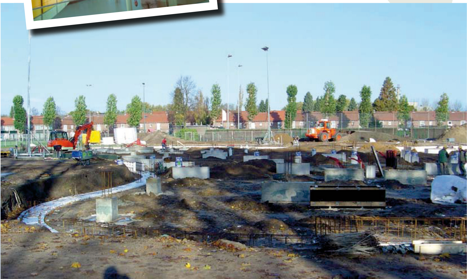
Groundwork in early November 2009, before construction of the school building commenced.

Phase two of the project involves construction of the 3,800 sq m sports hall,